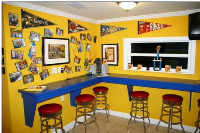
The Chi-Dog brings the taste of Chicago with a hint of New Orleans to Flagler County.

The Flagler Beach Chamber of Commerce would like to welcome its newest member. Chi-Dog (pronounced shy-dog) is located in downtown Flagler Beach. They specialize in Chicago style hot dogs. For the uninitiated, that means a genuine Vienna all beef dog on a steamed poppy seed bun with the following Chicago style toppings: mustard, onion, green relish, tomatoes, sport peppers (similar to banana peppers), celery salt